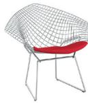
Diamond Chair 33½"W × 28¼"D × 30"H + Available in outdoor finish