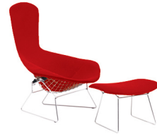
Bird Chair 38½"W × 33"D × 40¼"H Bird Chair Ottoman 23½"W × 17¼"D × 14½"H