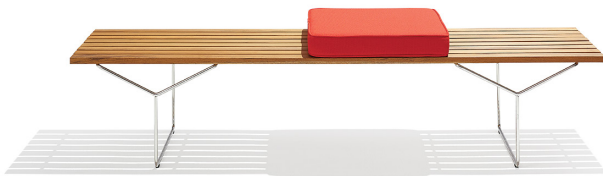
Harry Bertoia sketches (left), Harry Bertoia (below, right), Bertoia Bench (below, left)