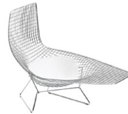
Asymmetric Chaise 52"W × 38½"D × 40¼"H