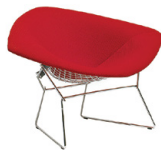
Large Diamond Chair 45"W × 31½"D × 28¼"H + Available in outdoor finish