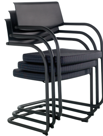
Black finish, Almost Black back and Mini Stitch, Twilight, seat